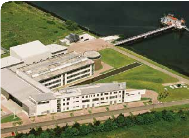
National Maritime College of Ireland

The NMCI provides education services of the highest quality. Specialist spaces including survival facilities, seamanship and shipwrights' workshops, fire-fighting/damage control, jetty and lifeboat facilities, and engine room are provided. The College also provides specialised simulation equipment in the areas of navigation, bridge training, communications, engineering machinery operations, liquid cargo handling/damage control and vessel traffic systems. These facilities fully comply with the most up-to-date international standards and requirements. A multi-purpose hall and sporting facilities are also included in the College. The College also undertakes refresher and short courses for STCW validation. See website for further details on these courses www.nmci.ie .